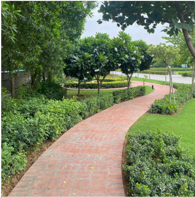
▲ TRL Riceland Pvt. Ltd. (Residential)