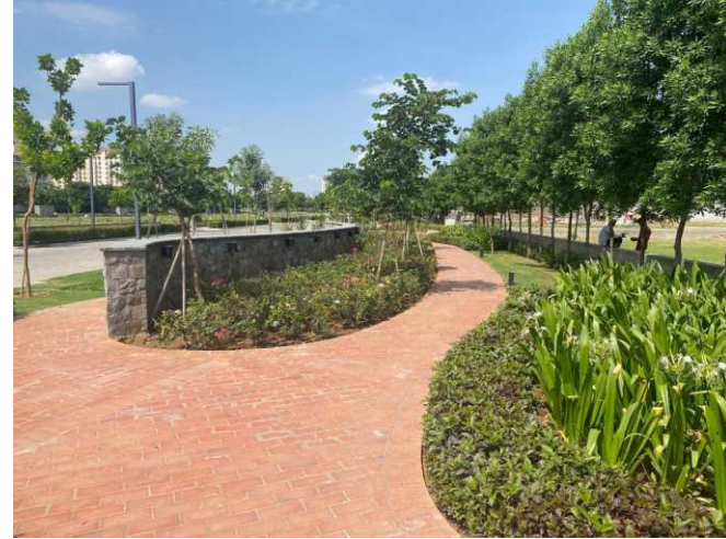
▲ TRL Riceland Pvt. Ltd. (Residential)