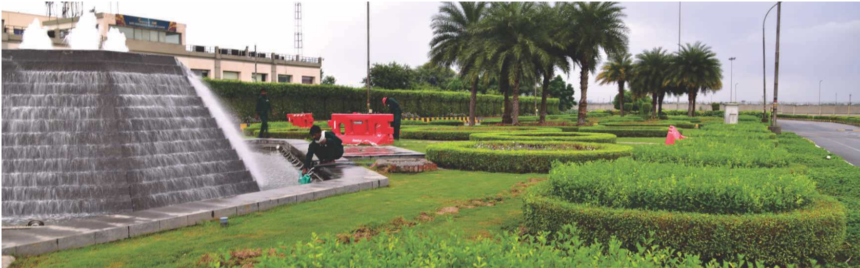
▲ GMR Airport (Airports)