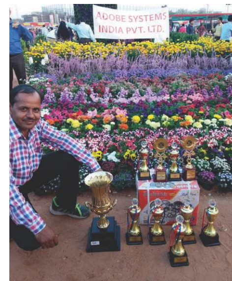
Best Landscape award by Adobe in 2017 & 2018