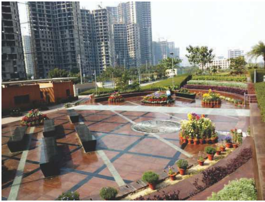
▲ Adobe 132 (Corporate)