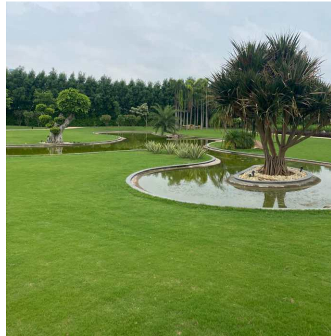
▲ TRL Riceland Pvt. Ltd. (Residential)