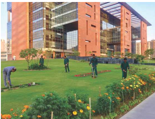
▲ Adobe 132 (Corporate)