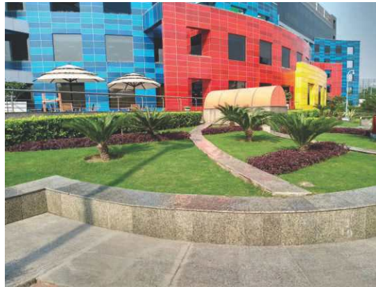
▲ Adobe 25A (Corporate)