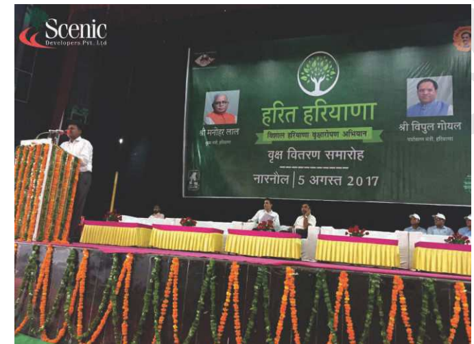
Social Contribution for Harith Hariyana, 2017