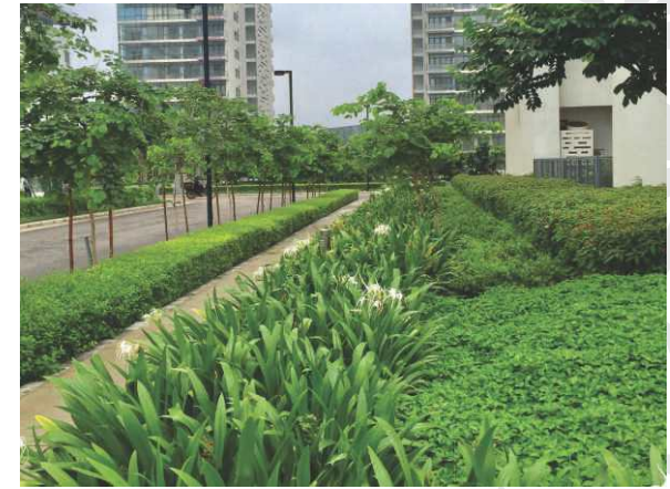
▲ Ireo (Housing)