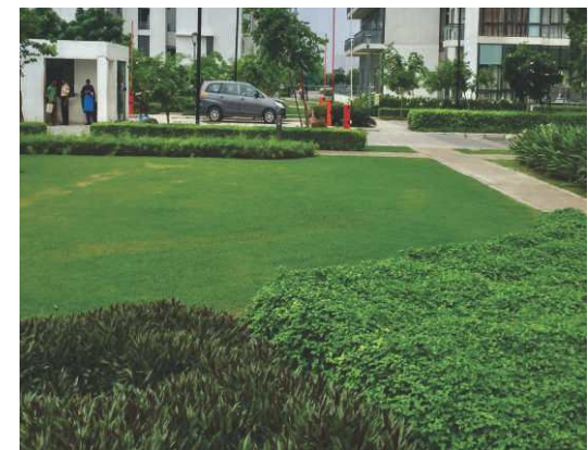
▲ Cherry County (Housing)