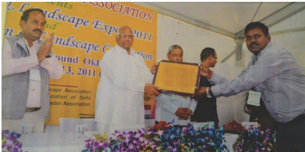
Recipient of best Landscape Contractor Award for the year 2011.