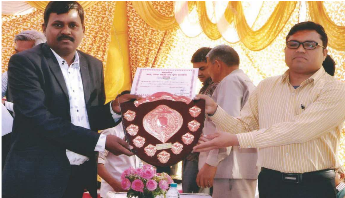
Best Landscape Maintenance Award for ITC Mughal Agra by Municipal Corporation, Agra for four years consecutively, 2016