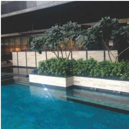
▲ Ambience (Hospitality)