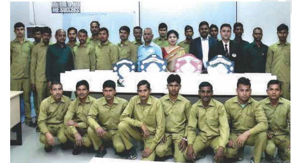
Best Landscape Maintenance Award by ITC Mughal, Agra, 2015