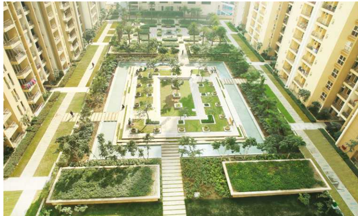
▲ Cleo County