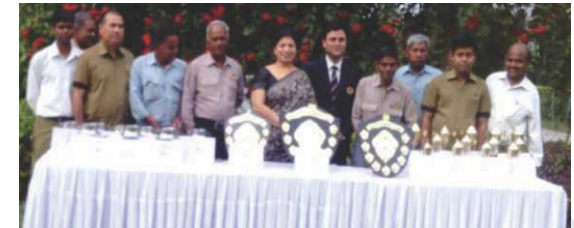
Best Landscape maintenance award by ITC Mughal, Agra 2014