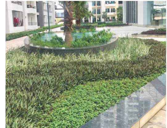
▲ Cleo County (Housing)