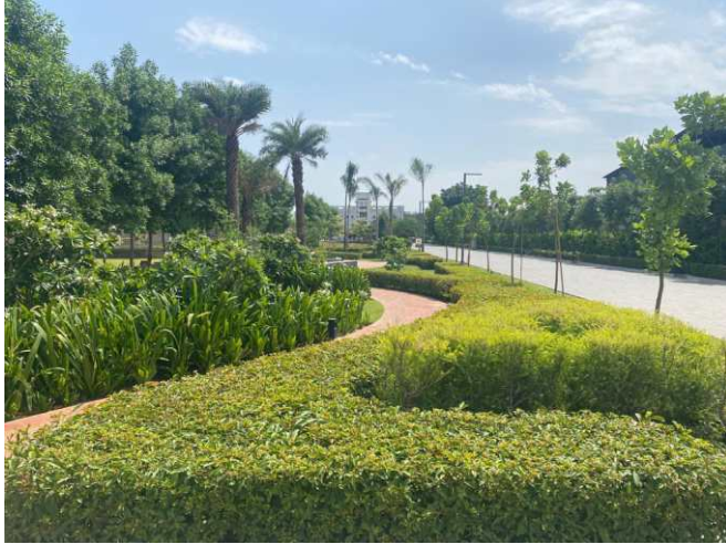
▲ TRL Riceland Pvt. Ltd. (Residential)