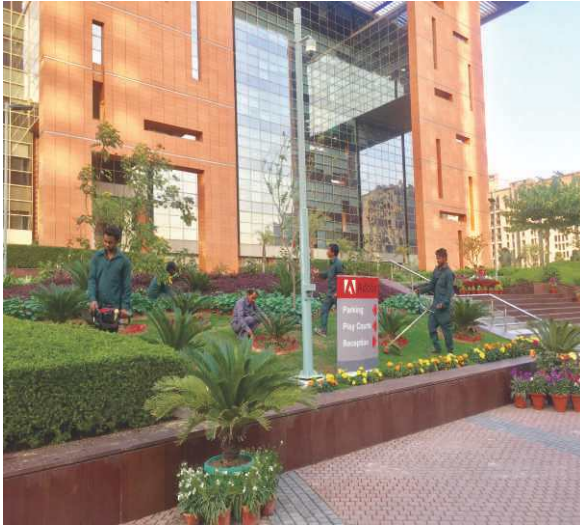
▲ Adobe System Pvt. Ltd. (Corporate)

We have the expertise to develop the project right from scratch, with designing to execution of the project. Our portfolio of projects speaks for itself.