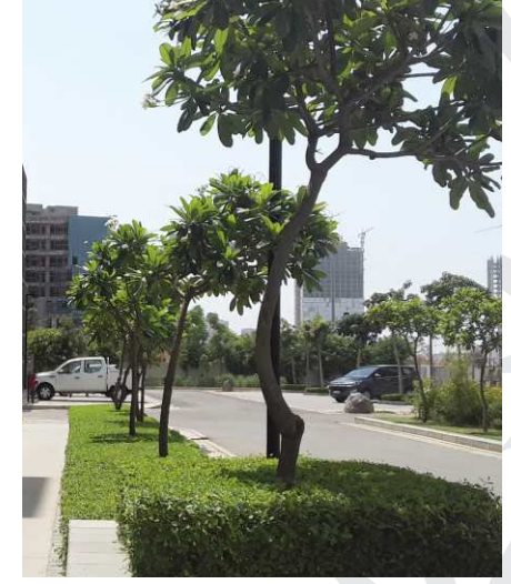
▲ Ireo Grand Arch